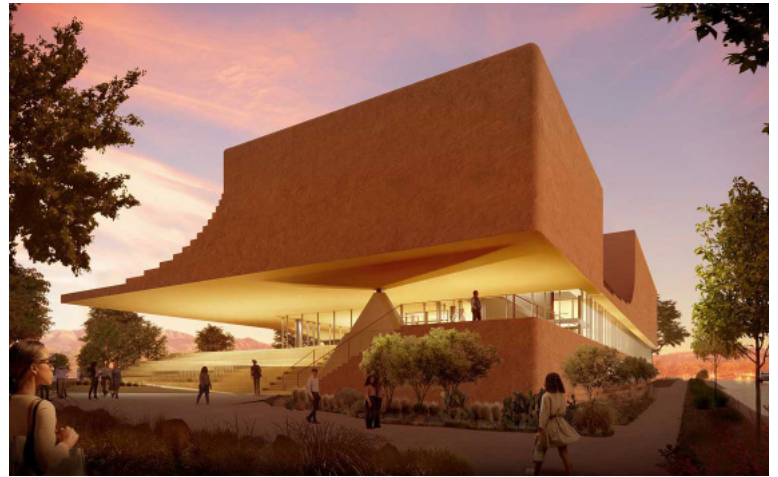
An artist's rendering of a completed CCAT.