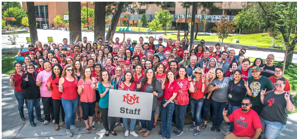
Final day of Staff Appreciation Week, May 2019.