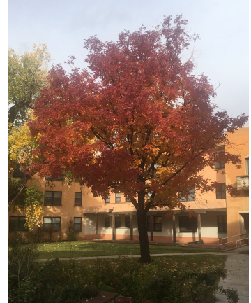
Autumn foliage in courtyard of Hokona-Zuni Hall at UNM

A PDF version of this weekly brief is available on the Academic Affairs website . Your feedback and input are welcome at provost@unm.edu .